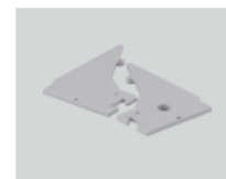
End Cap With hole End Cap without hole