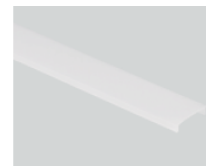
PC Diffused Diffuser