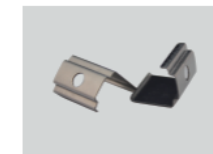
Mounting clip (metal)