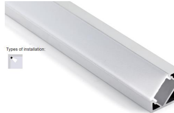
Types of installation: