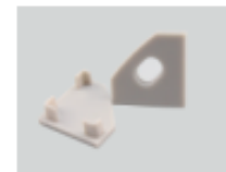
End Cap With hole End Cap without hole