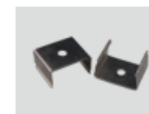
Mounting clip (metal)